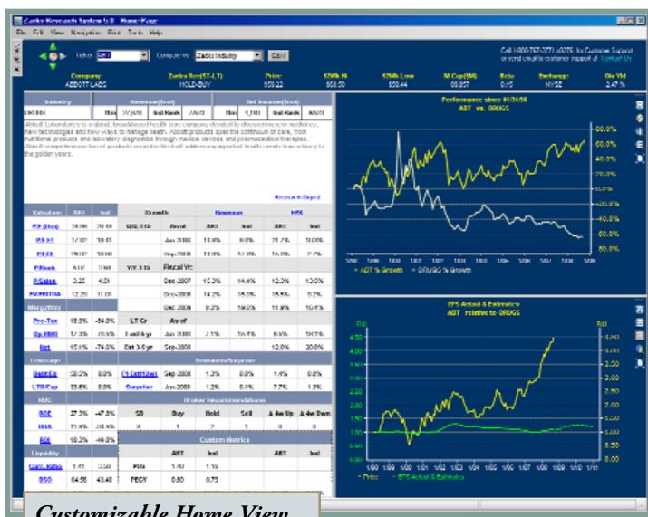
Customizable Home View

CUSTOM HOME PAGE- Your custom home page can consist of 1 to 4 windows, each displaying any of the 16 ZRS modules. This enables you to monitor portfolios using 15 minute delayed prices in one window, while you display your custom valuation charts in another window. This is just one example of the countless combinations you can create in ZRS.